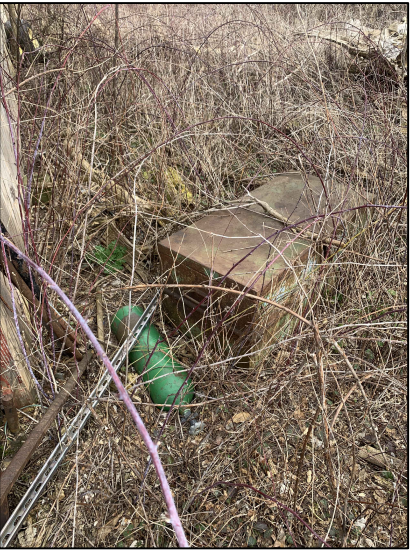
PHOTO 12 CONTRACTOR RESPONSIBLE FOR REMOVAL OF MISCELLANEOUS DEBRIS (TOOLBOX, OXYGEN TANK, ETC.)