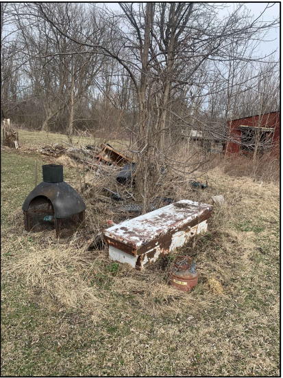
PHOTO 11 CONTRACTOR RESPONSIBLE FOR REMOVAL OF MISCELLANEOUS DEBRIS (TOOLBOX, GAS CAN, FIRE PIT, ETC.)