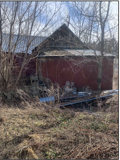
PHOTO 6 CONTRACTOR RESPONSIBLE FOR REMOVAL OF MISCELLANEOUS DEBRIS (CONCRETE BLOCK AND STEEL SIDING, ETC.)