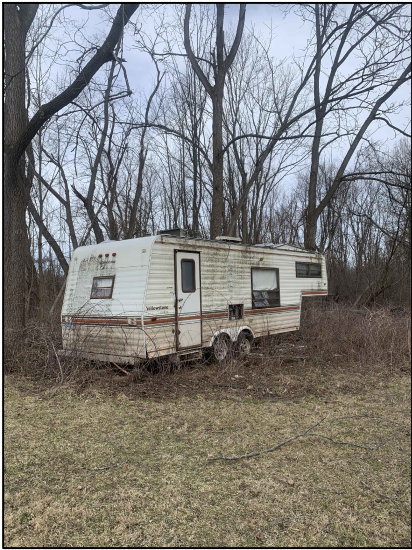
PHOTO 1 CONTRACTOR RESPONSIBLE FOR REMOVAL OF 5TH WHEEL CAMPING TRAILER