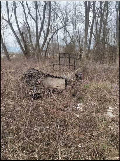
PHOTO 2 CONTRACTOR RESPONSIBLE FOR REMOVAL OF LANDSCAPE TRAILER