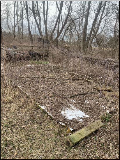
PHOTO 3 CONTRACTOR RESPONSIBLE FOR REMOVAL OF WOOD FLOOR AND DEBRIS