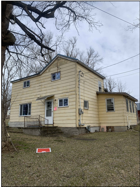
BUILDING PHOTO (CONTROLLED DEMOLITION AS PER NYSOL 56-11.5)