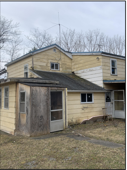
PHOTO 13 CONTRACTOR RESPONSIBLE FOR REMOVAL OF 2 STORY HOUSE AND ATTACHED PORCHES