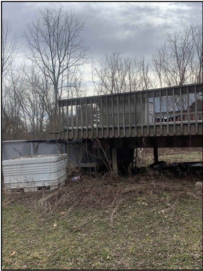
PHOTO 8 CONTRACTOR RESPONSIBLE FOR REMOVAL OF POOL, DECK, AND STORAGE CUBE