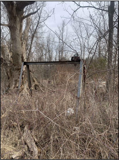
PHOTO 9 CONTRACTOR RESPONSIBLE FOR REMOVAL OF ENGINE HOIST