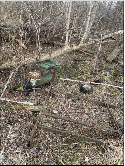
PHOTO 4 CONTRACTOR RESPONSIBLE FOR REMOVAL OF MISCELLANEOUS DEBRIS