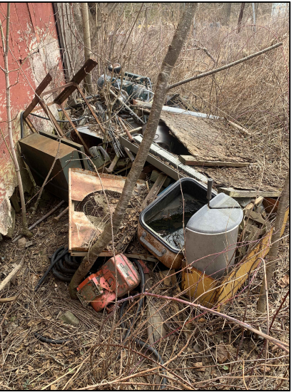
PHOTO 7 CONTRACTOR RESPONSIBLE FOR REMOVAL OF MISCELLANEOUS DEBRIS