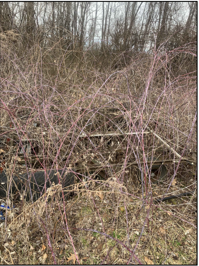
PHOTO 5 CONTRACTOR RESPONSIBLE FOR REMOVAL OF UTILITY TRAILER AND MISCELLANEOUS DEBRIS