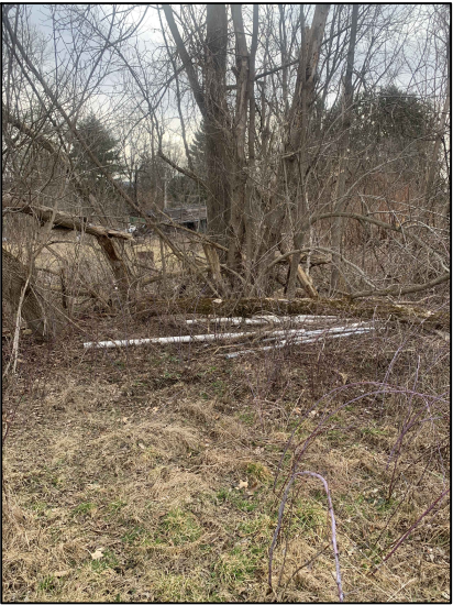
PHOTO 10 CONTRACTOR RESPONSIBLE FOR REMOVAL OF PVC PIPE