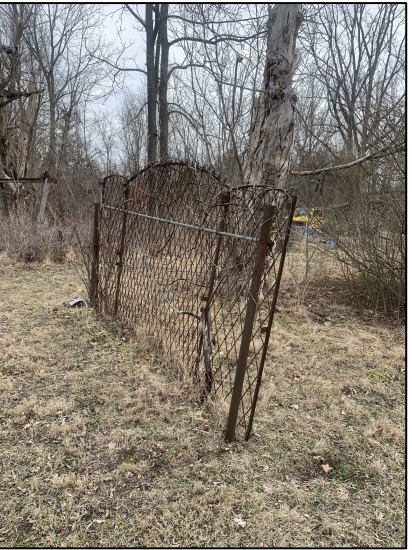
PHOTO 14 CONTRACTOR RESPONSIBLE FOR REMOVAL OF TRESTLE

WARNING IT IS A VIOLATION OF SECTION 7209, SUBDIVISION 2, OF THE NEW YORK STATE EDUCATION LAW FOR ANY PERSON, OTHER THAN THOSE WHOSE SEAL APPEARS ON THIS DRAWING, TO ALTER IN ANY WAY AN ITEM ON THIS DRAWING. IF AN ITEM IS ALTERED, THE ALTERING ENGINEER SHALL AFFIX TO THE ITEM HIS SEAL AND THE NOTATION "ALTERED BY" FOLLOWED BY HIS SIGNATURE AND THE DATE OF SUCH ALTERATION, AND A SPECIFIC DESCRIPTION OF THE ALTERATION.